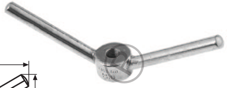
Nakrętka dwuramienna A4